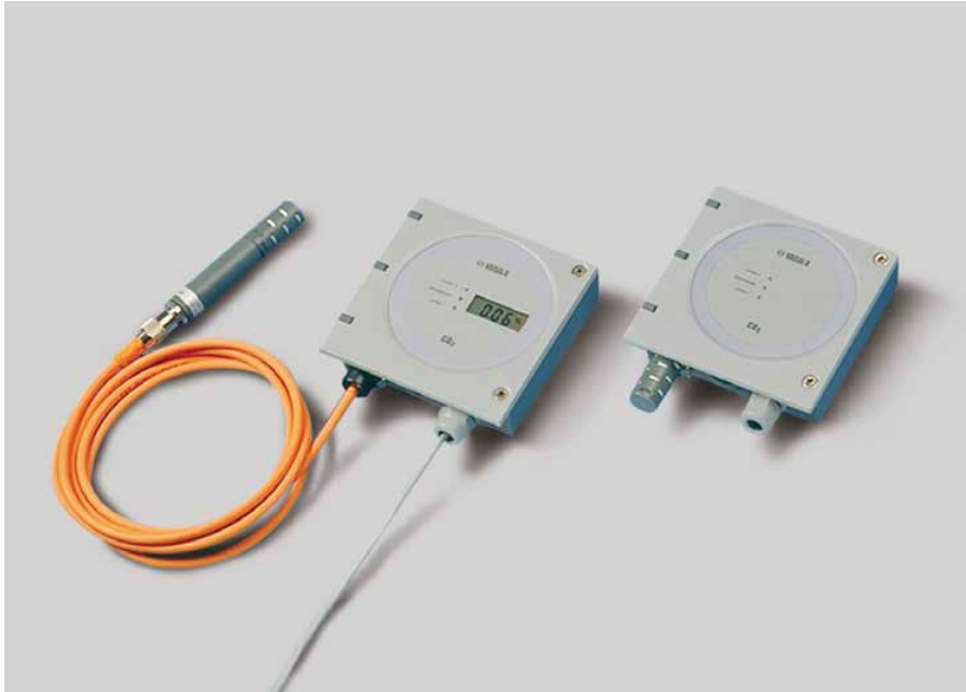
The GMT220 transmitters withstand harsh and humid environments.