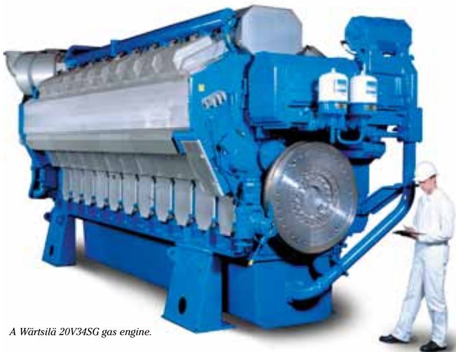
A Wärtsilä 20V34SG gas engine.

When the new generation of Vaisala HMT330 humidity transmitters was launched, a suitable replacement for the HMP231 was discussed at length, and the product's direct successor HMT331 was selected as such. However, it was already then clear that in some plant locations the outdoor conditions are so harsh that the more advanced version HMT337 should be used.