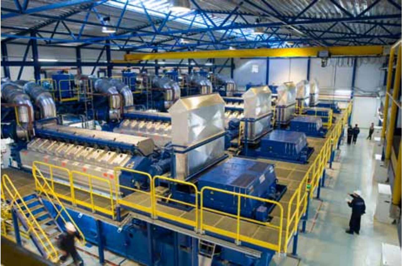
Wärtsilä power plant with multiple generating sets ensuring flexible power generation.

The humidity sensor also features a purge function that frequently evaporates any chemical contaminants that might have been absorbed into its sensing area, such as gaseous air pollutants. The purge cleans the sensor internally, improving its stability and measurement accuracy.