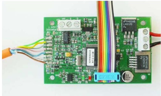
Figure 3 GMT220 (left) and GMM220 (right)