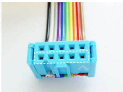
Figure 2 Connect the First Row

You also have to connect the operation power to the transmitter. Refer to the User’s Guide of the transmitter for power supply requirements and connections.