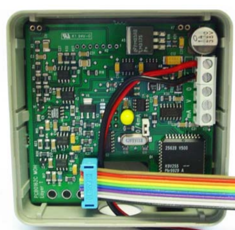
Figure 5 GMW20 (left) and GMD20 (right)